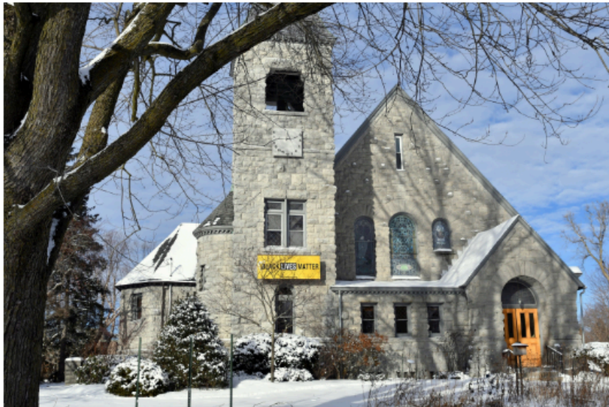
Unitarian Universalist church in Canton, New York, was built in 1897 and has many historic features, including a bell tower and stained glass.